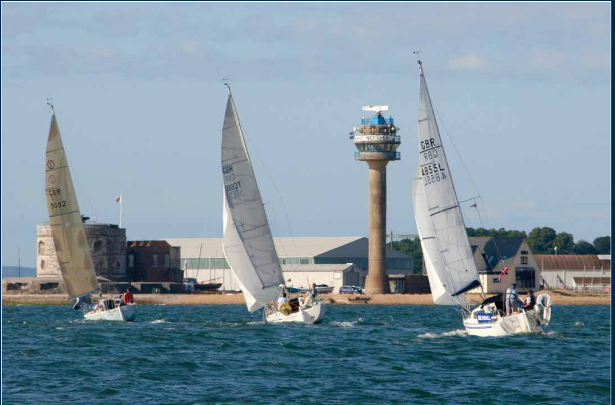
Demonstrating angles of heel