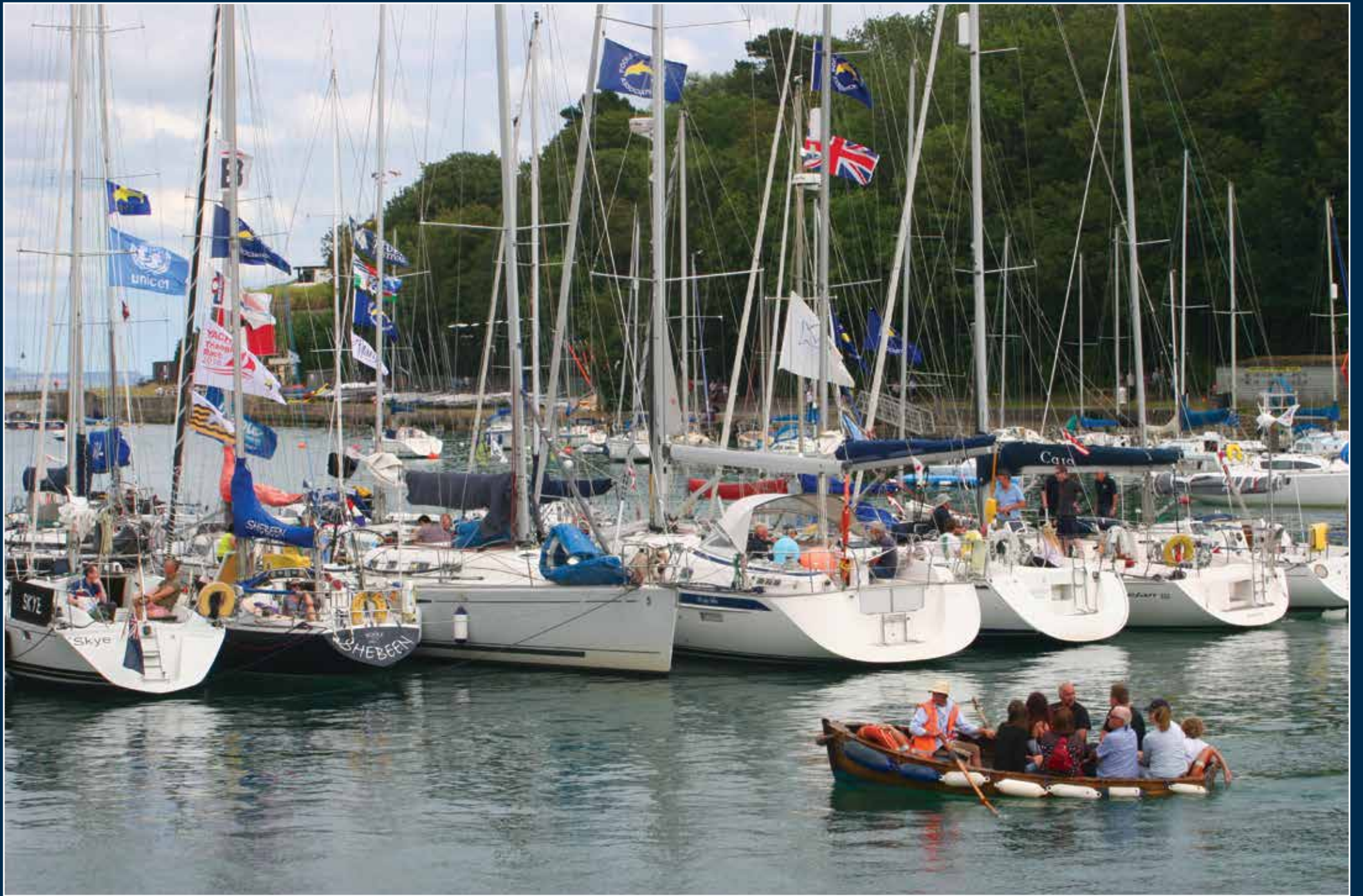
PYRA making a bridge across Weymouth harbour