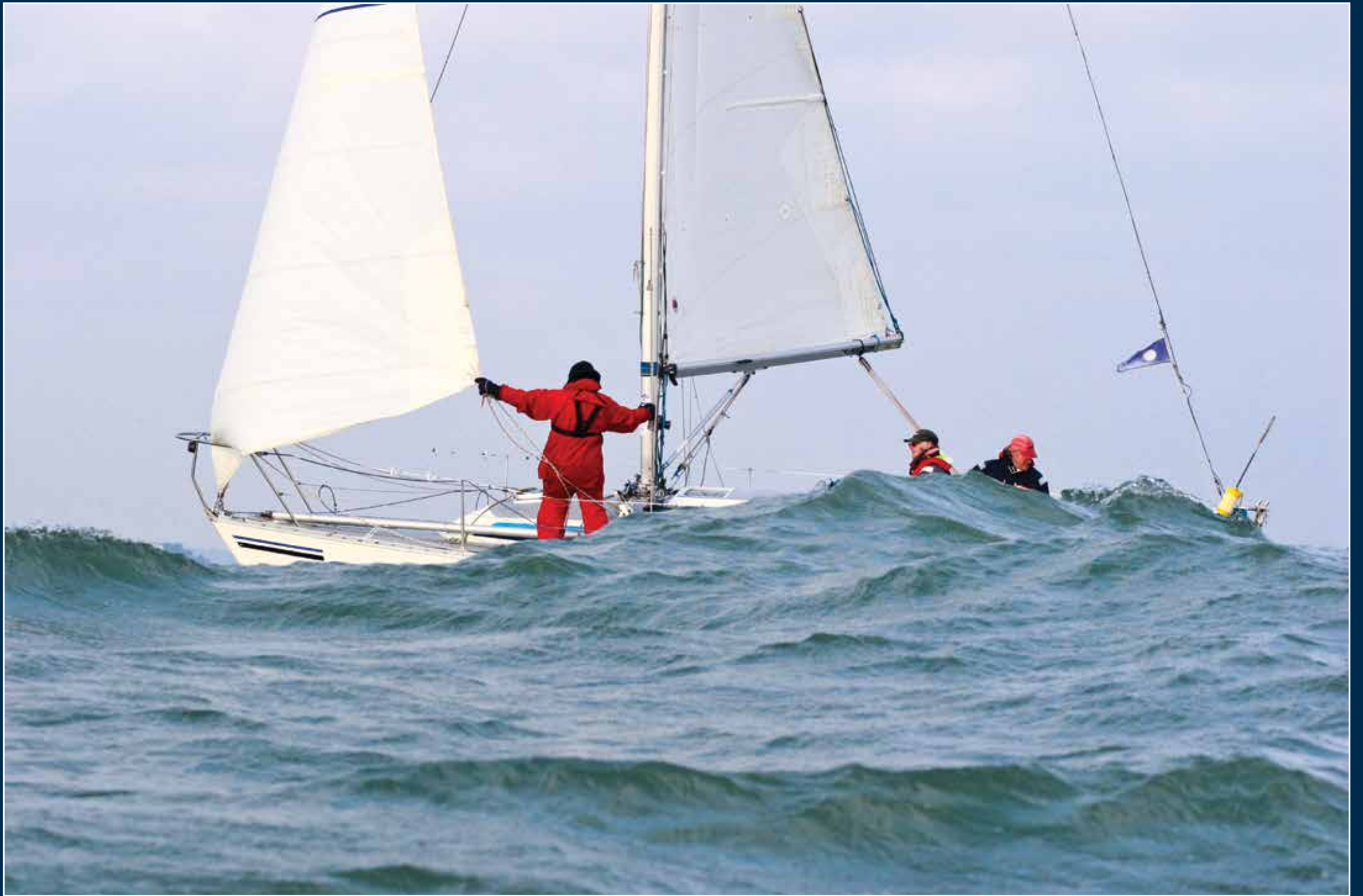
Hiding from the fleet