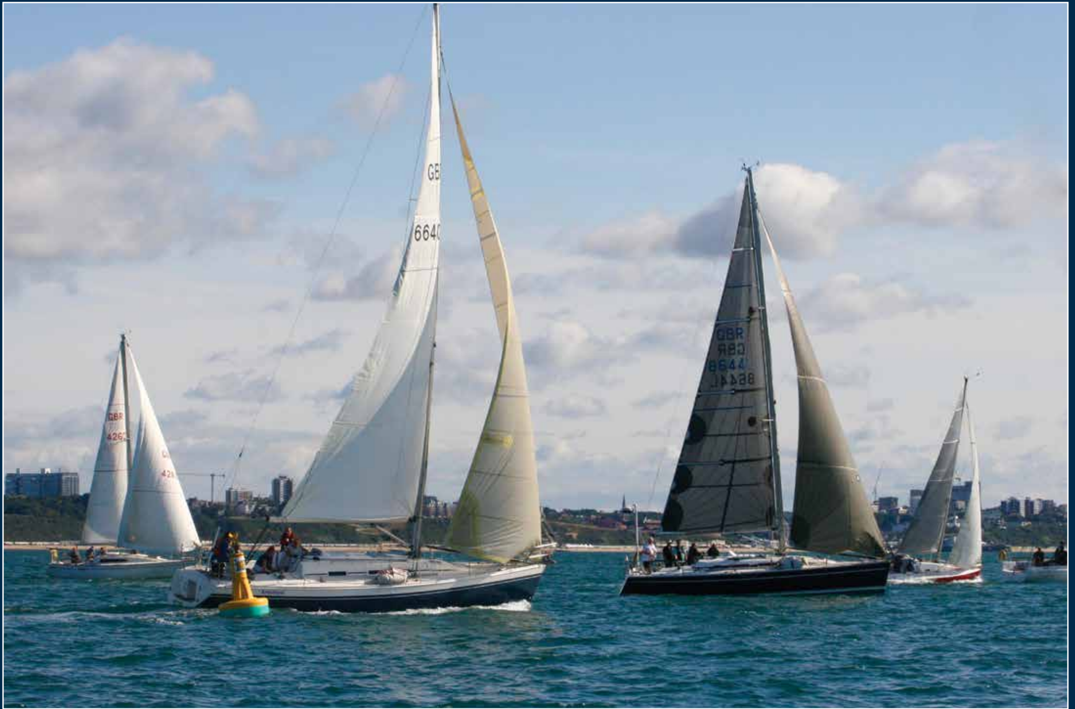
Close start for Class 1