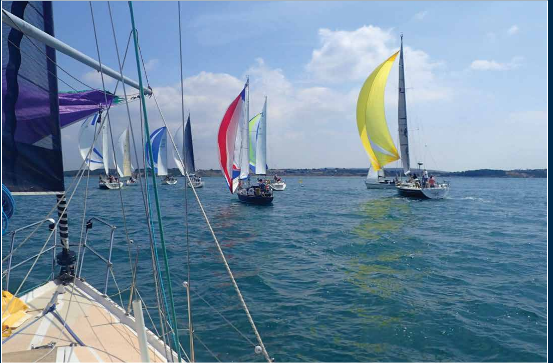
Lovely summer sailing to the Hamble