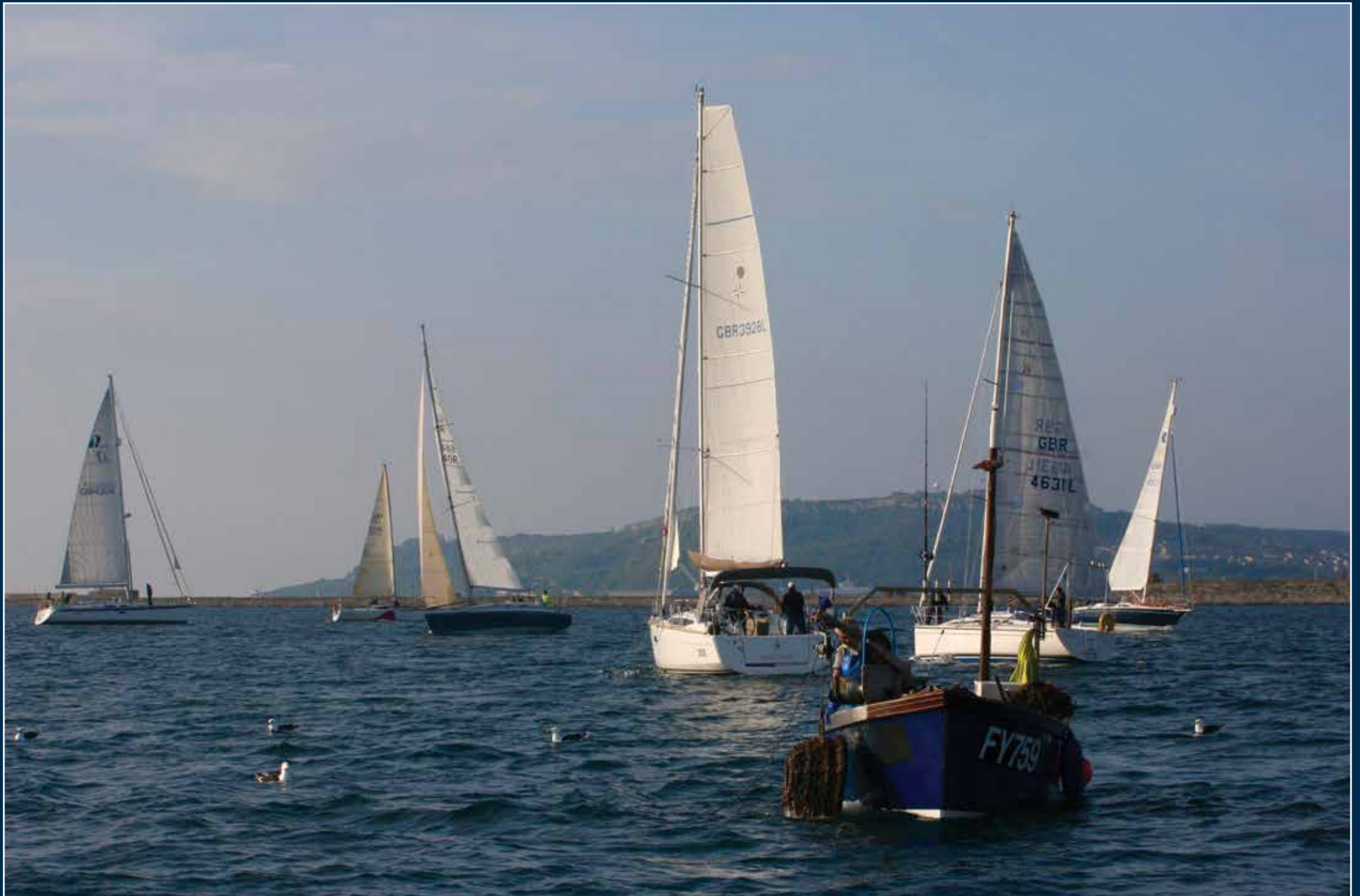
Just when you've set the start line.....