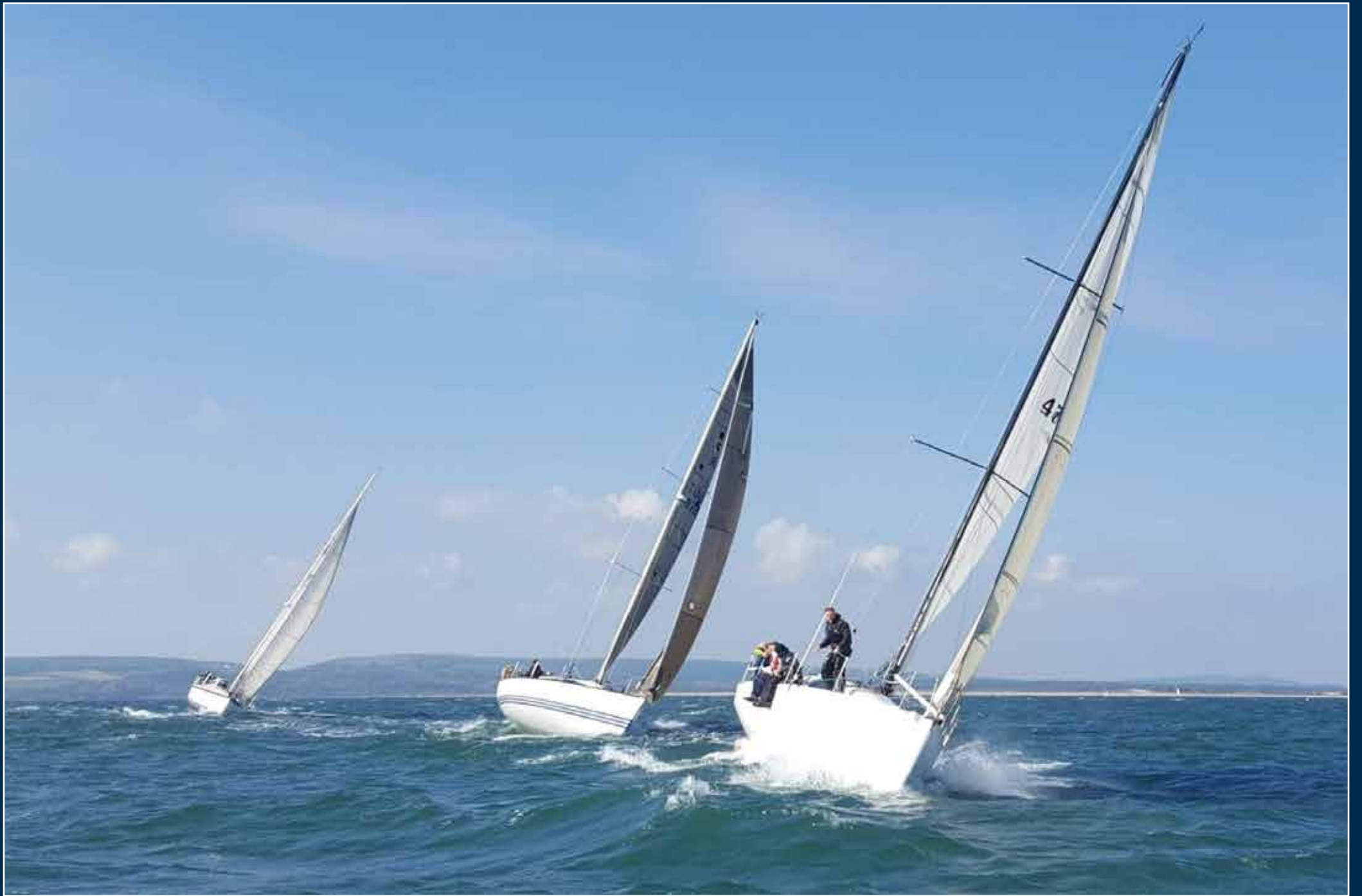
The season starts with the Pursuit Race