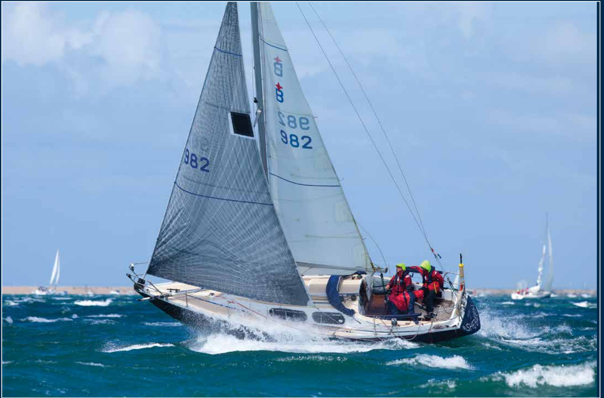
Shebeen almost flying