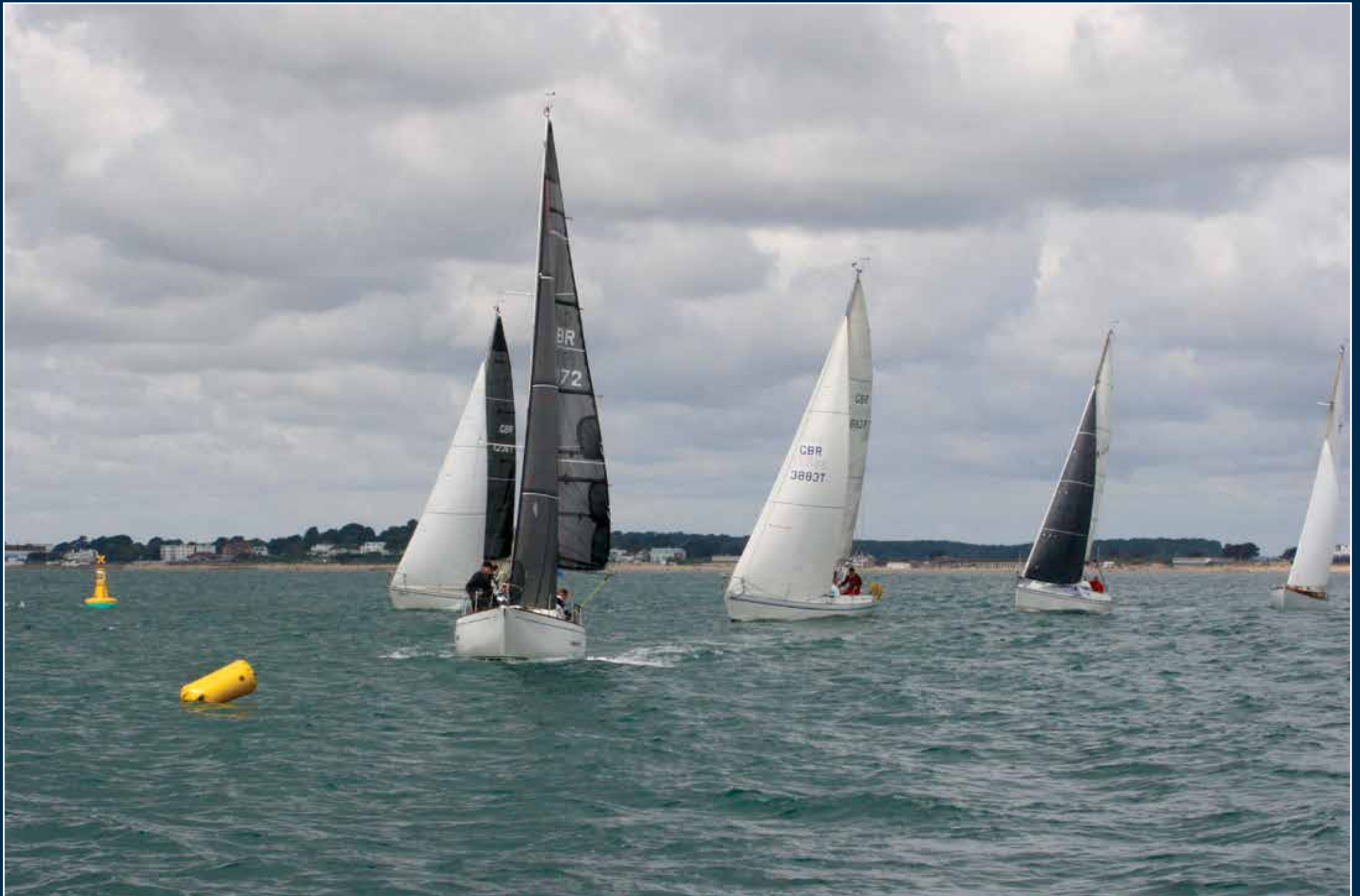
Class 3 looking competitive