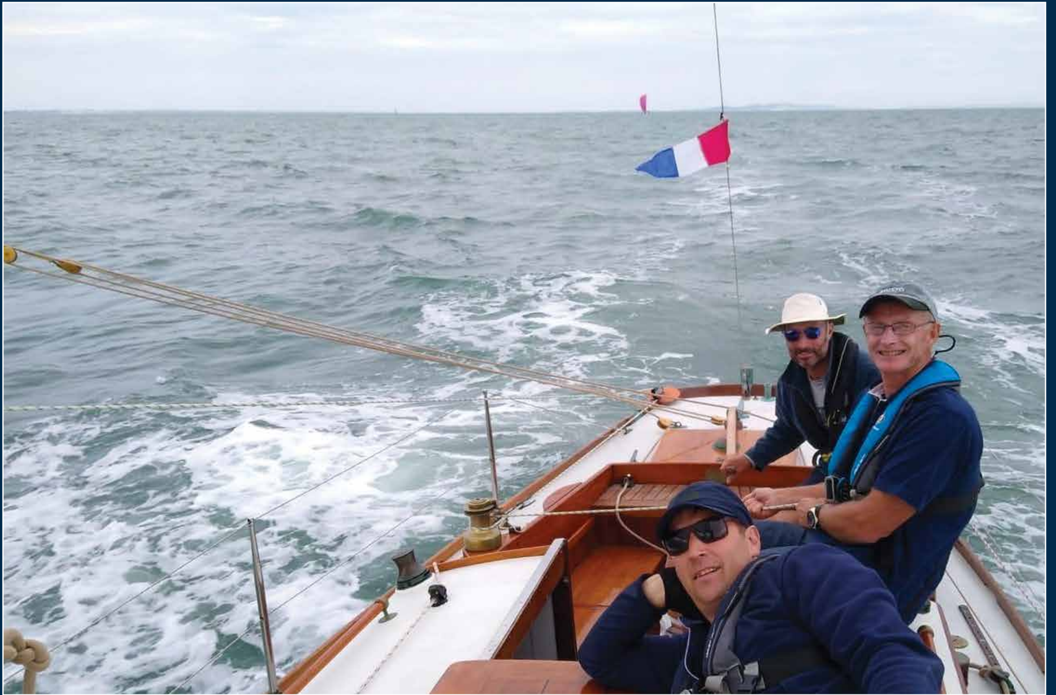
Ampere's laid back style